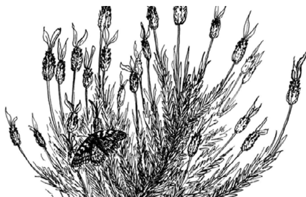
Lavandula luisieri with Spanish Festoon butterfly

C. cardunculus , the cardoon – it still makes a statement with imposing, electric blue flowers and sculptural spiky leaves. Eryngiums flower in midsummer, accompanied by the complimentary sulphur-yellow of Helichrysums and rhyming with the now-dried seed-heads of the annuals and grasses. Lagurus ovatus , Brizas large and small, and the fascinating starbursts of Aegilops geniculata are personal favourites.