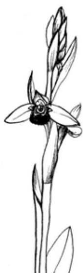
Ophrys apifera coming into bloom

After this consultation with the “genius of the place”, a revolutionary, yet obvious, conclusion was drawn – go back to nature. The new Hapimag garden would be planted exclusively with native species from the Algarve coast. The landscape architects developed their plans rigorously, utilizing a few fundamental matrices of plants which would be employed in given areas, depending on the specific conditions of soil, neighbouring species, light and shade in each situation. These choices, based on combinations of species found in the wild, should ensure that the new plant communities will not just survive in their situation, but thrive and become quickly self-sufficient.