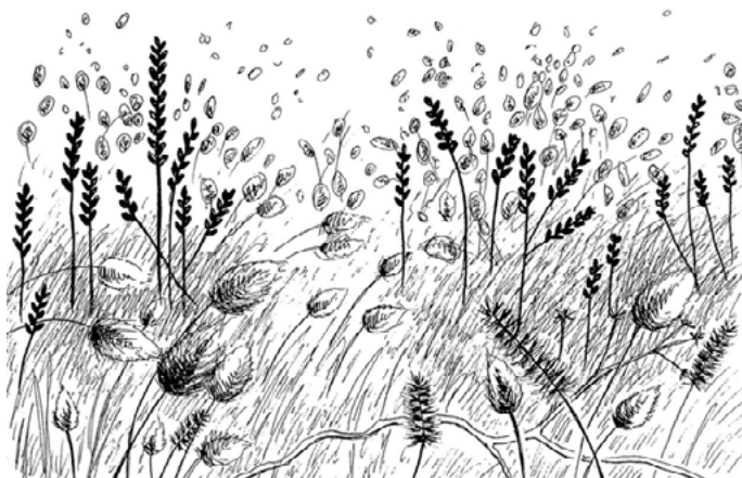
Dried seedheads dance in the evening sunlight: Bellardia trixago, Lagurus ovatus and Trifolium angustifolium

zingy palette from mid-February often until the end of June. We have built a composting area and the garden waste which, in the past, was taken off site at great expense, is now composted or shredded and returned to the garden as mulch. The difference this makes to the texture, temperature and water-retaining capacity of our frequently sandy soil is evident almost immediately.